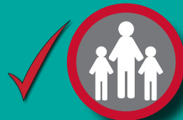
RULE OF 2 1 adult, 2 children