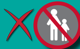
1 adult, 1 child