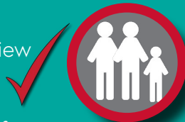
RULE OF 2 2 adults, 1 child